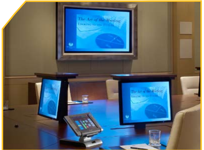
Red Rock Boardroom at The Phoenician